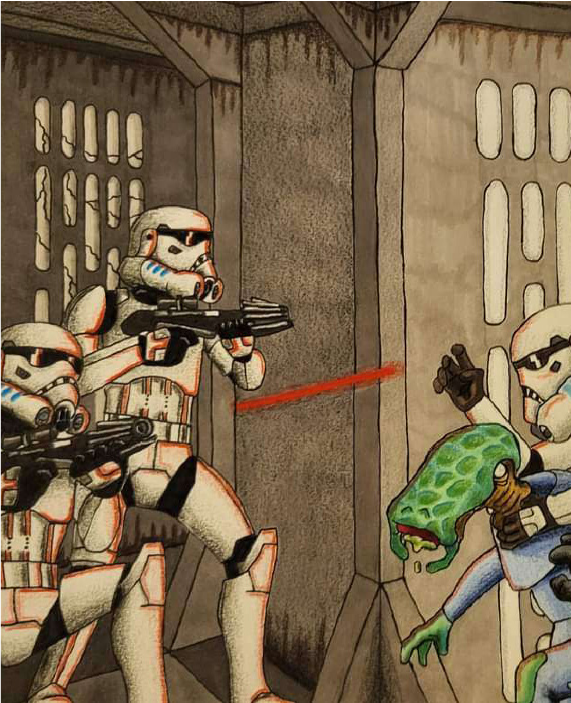
Art Credit: MRD Maston Dane / Stingray Battleteam