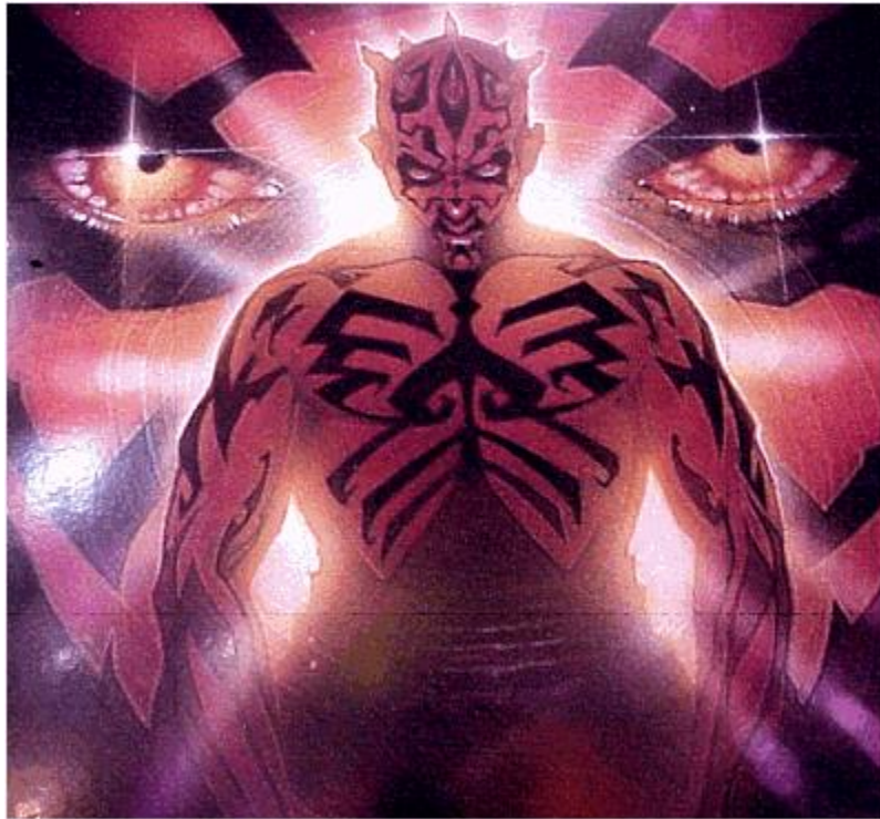
The first image of Darth Maul's skin, as painted by master artist Drew Struzan.